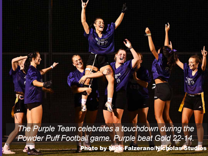
The Purple Team celebrates a touchdown during the Powder Puff Football game. Purple beat Gold 22-14.